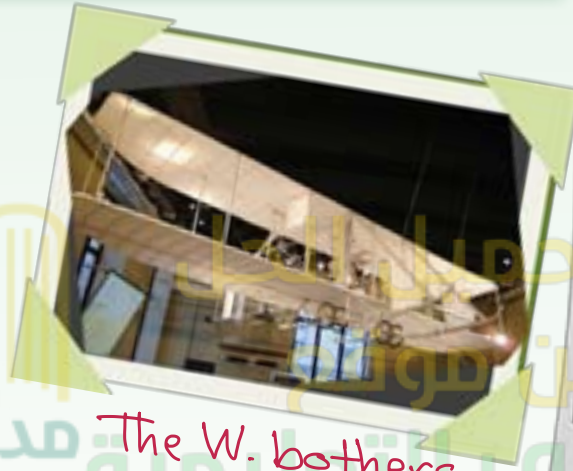
The W. brothers