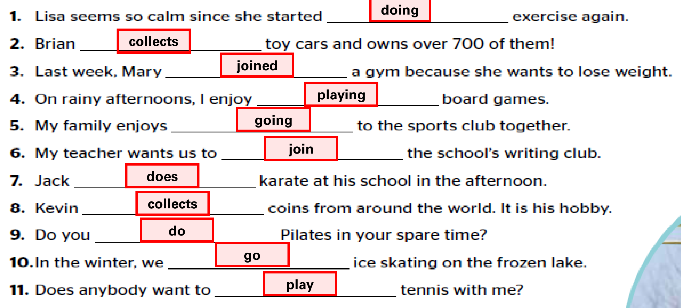
I . Complete with the correct form of the verbs play, go, do, join or collect.