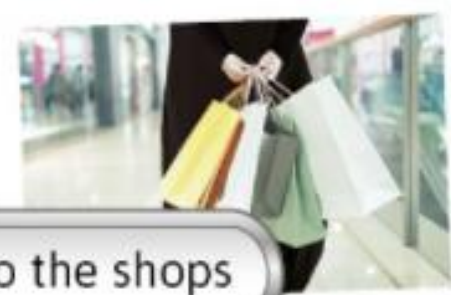
E. to the shops