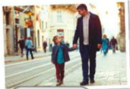
A. a walk