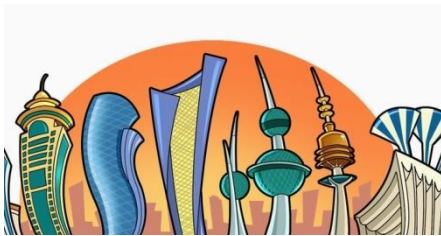
( shops - Kuwait City)