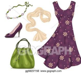
( bag - necklace)