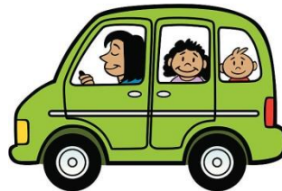
( mother - car)