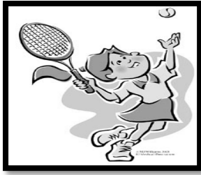
like - tennis

Write a short paragraph of 3 sentences about " My hobby "