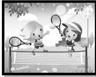
play - friend