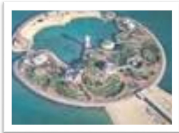
Geen Island/beautiful place

*Write a short paragraph of 4 sentences on " Green Island" with the help of pictures and guide words:-