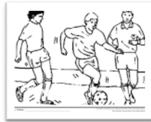
play /water football