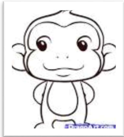
Monkeys/ the cleverest animal

*Write a short paragraph of 4 sentences on " Monkey" with the help of pictures and guide words :-