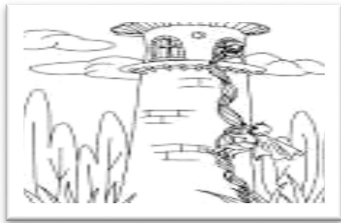
climb up / tower