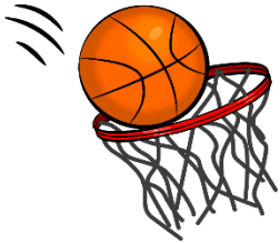
( favourite - playing)