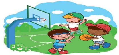
(Saturday - friends)