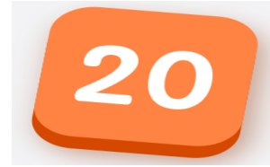
(twenty - shells )