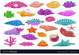
(collecting - shells )

Write three sentences about " my hobby " by the help of guide pictures and words