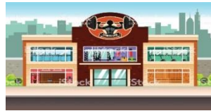
( join - club)