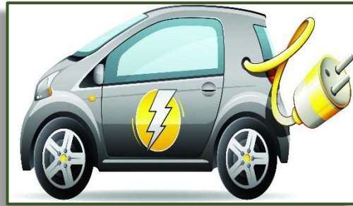
Using electric cars