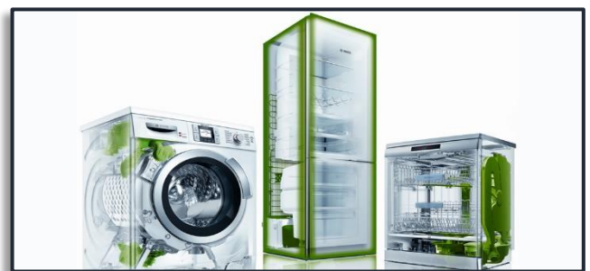
Use energy saving appliances