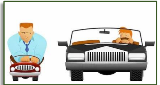
Using smaller cars