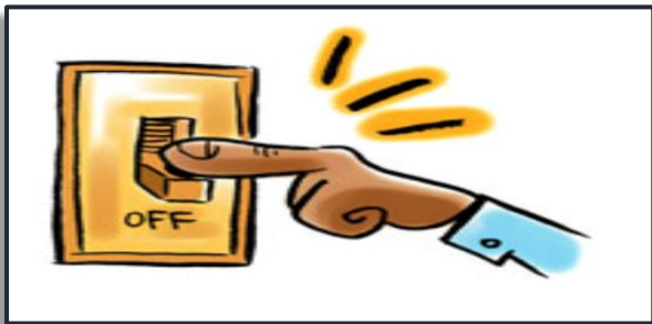
Turn off the lights after use