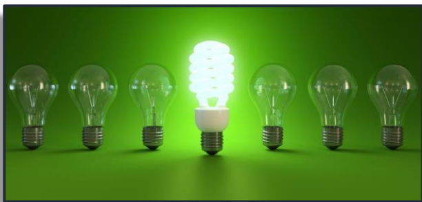
Use light bulbs