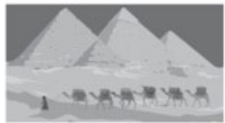
1 Pyramids of Giza