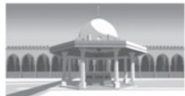
2 Mosque of Amir ibn al-As