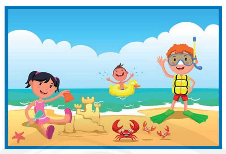
swim, build, run, play, eat, family

She builds. a sand castle. They swim..... happily.