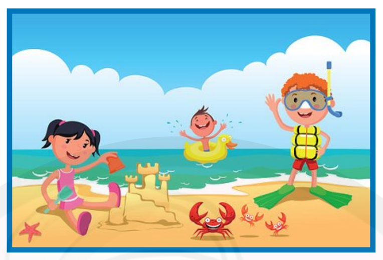
swim, build, run, play, eat, family

She .....a sand castle. They ..... happily.